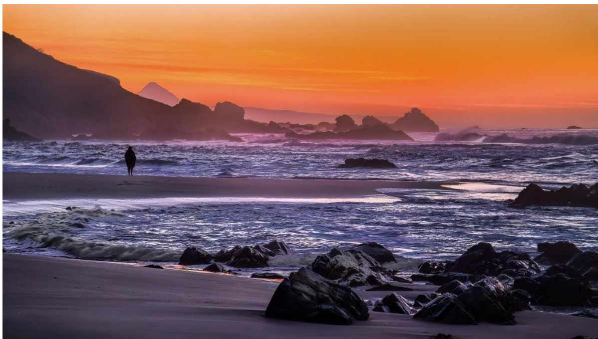
Standing alone – Eileen Covarr