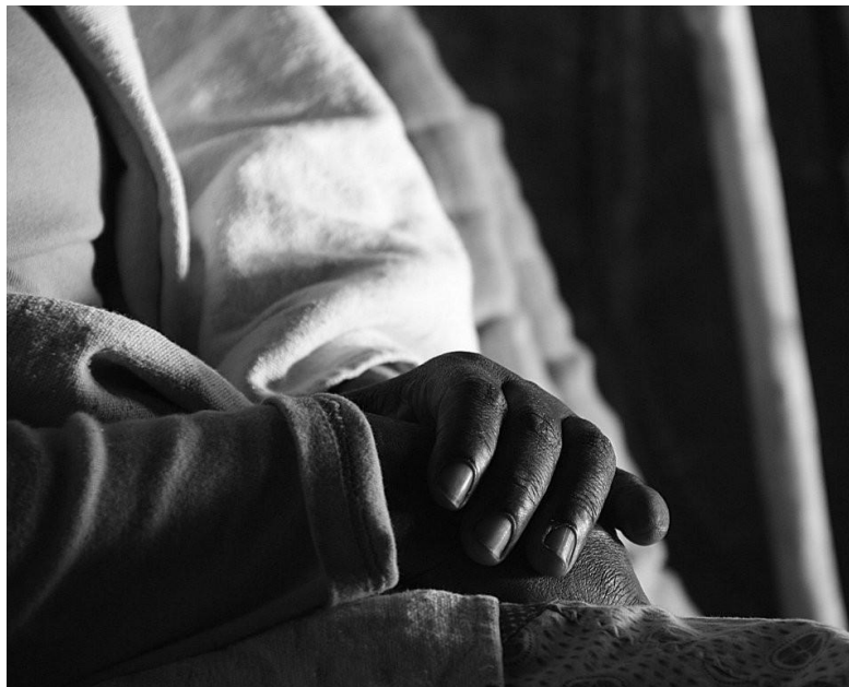
Solitary - 3 rd