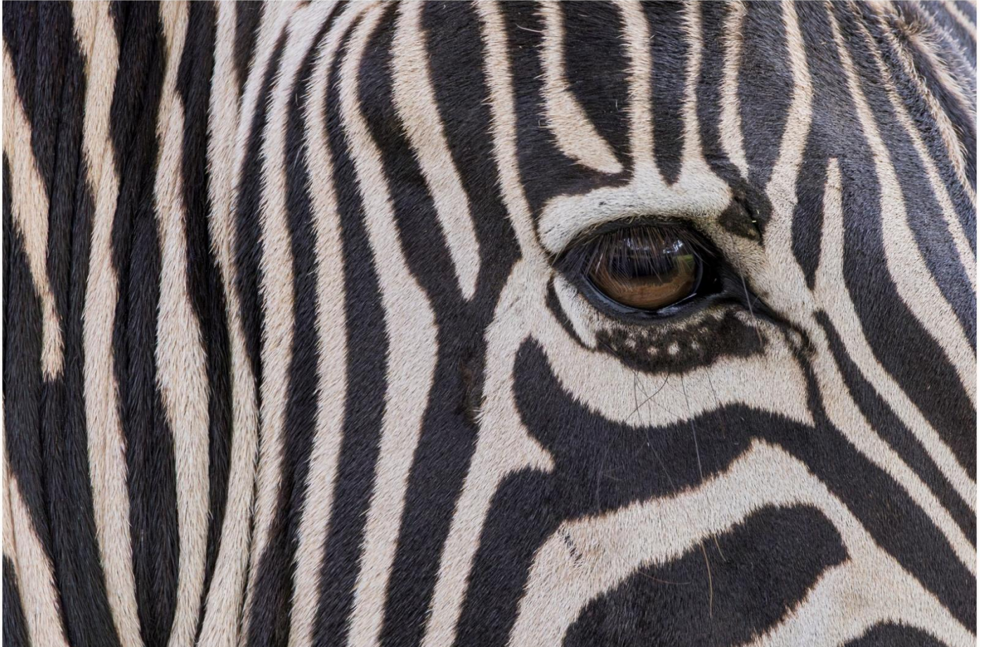
Zebra eye – Terence Clarke

The Knysna Photographic Society is proudly affiliated with the PHOTOGRAPHIC SOCIETY OF SOUTH AFRICA