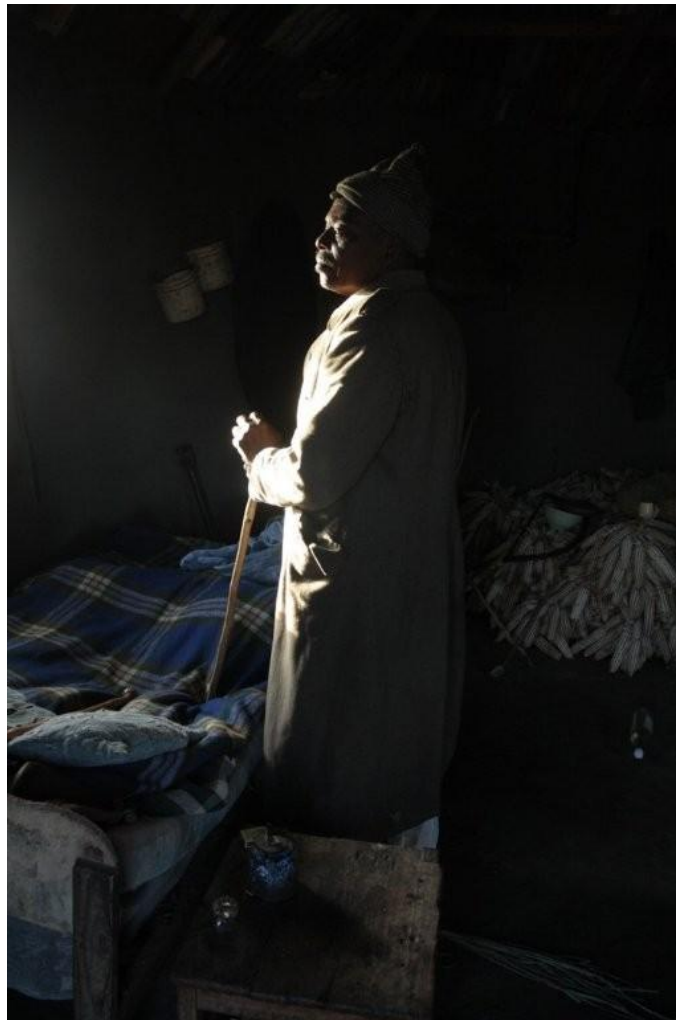
Solitary man – 2nd